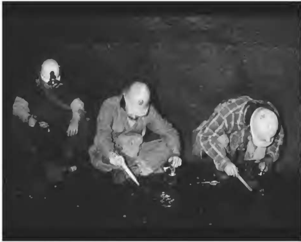
Fig. 6. Three former Ecological Science graduate students from Old Dominion University collecting crustaceans from a cave stream in Lee County.